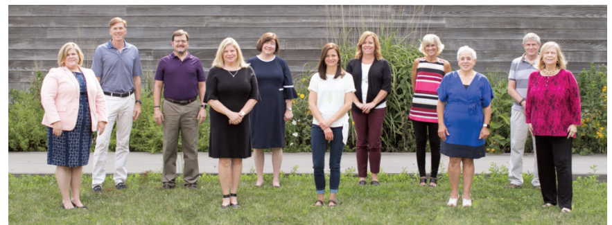
Prevention Action Alliance Board of Directors, Fiscal Year 2021