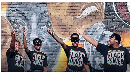
Distinguished Gentlemen of Spoken Word, Cleveland, Ohio presenting at the 2021 PAAS on Racism